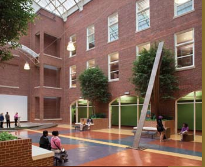
FIRM: FANNING HOWEY

Entry Form Due March 7, 2012 • Portfolio Due April 13, 2012