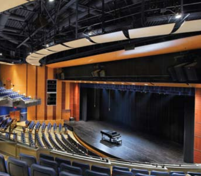
FIRM: CR ARCHITECTURE + DESIGN, PHOTO: WILLIAM MANNING PHOTOGRAPHY